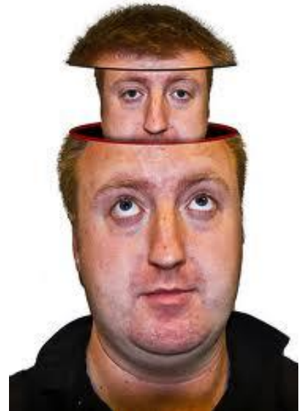
Two heads are better than one

For further information about Art of Technology, our services and a selection of customer projects, refer to www.aotag.ch .